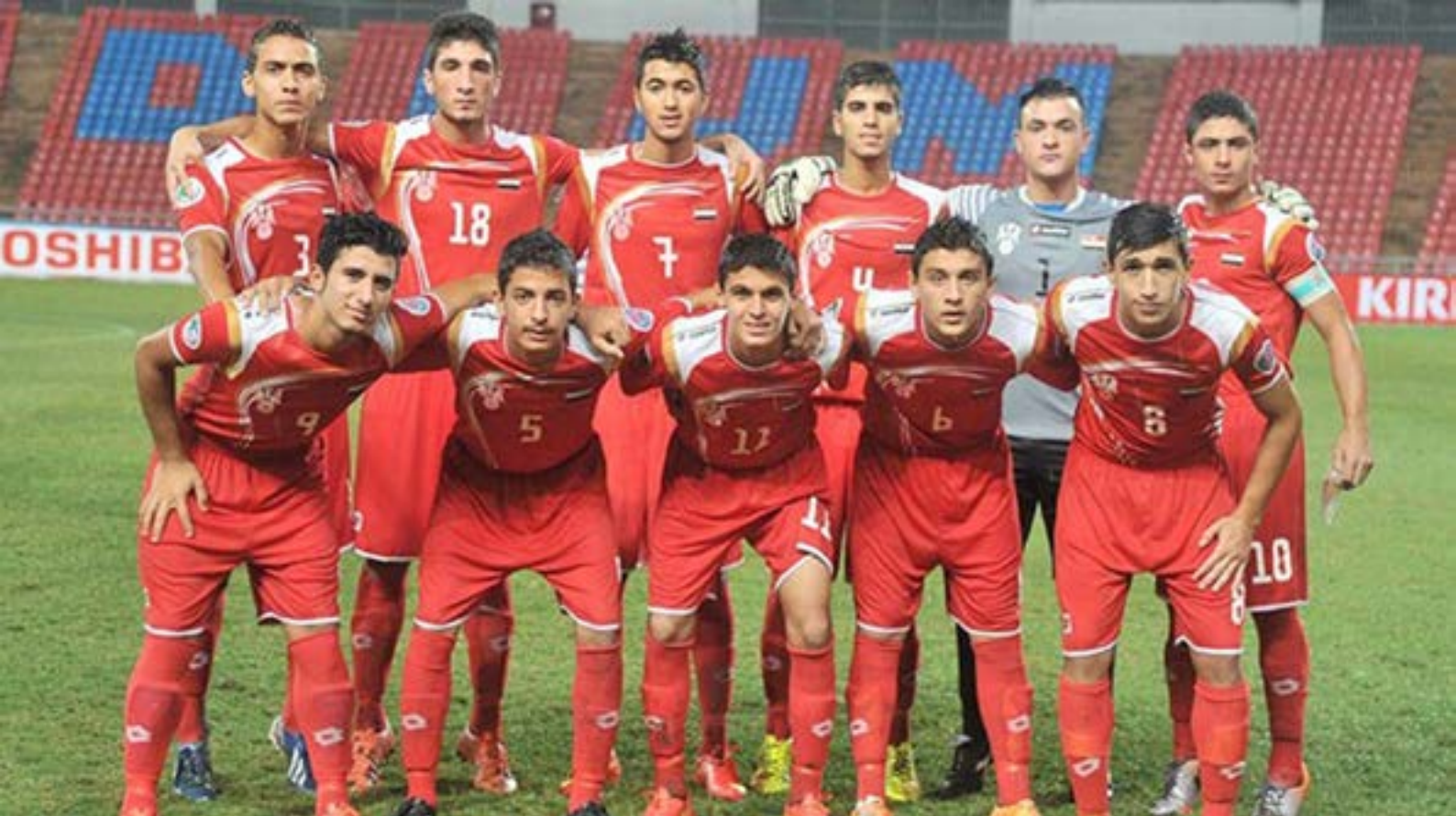
Syrian U-17 National Football Team, 2015.